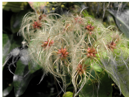
Clematis vitalba, Old Man's beard